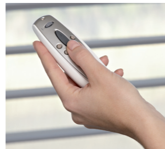
3 PowerRise® and motorized operation