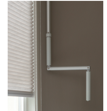
7 Crank operation