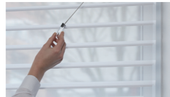
2 SmartCord® and UltraLift™