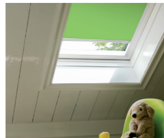
5 Skylight, Nano Blinds and tensioned models